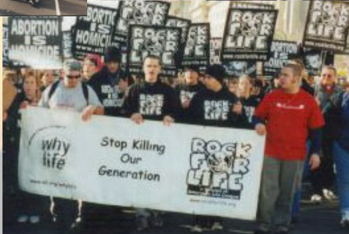
"Rock for Life" members at the March for Life in Washington D.C. Jan, 2002