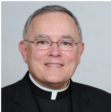
Most Reverend Charles J. Chaput, O.F.M. Cap

Most Reverend Charles J. Chaput, O.F.M. Cap. “CS Lewis on ‘Xmas and Christmas’.” Denver Catholic Register (December 8, 2005)